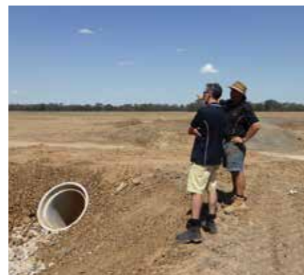
The next round of the Farm Water Program will help irrigators improve on-farm water use, with at least half of the water savings returned to the government for environmental purposes.