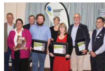
Supporting and recognising the community's vital role in improving and protecting the catchment's land, water, biodiversity and productivity is critical to implementing the Regional Catchment Strategy.