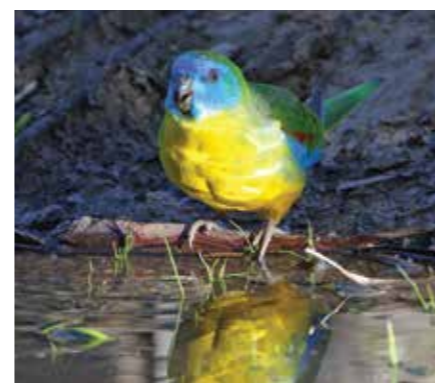
Broken Boosey Conservation Management Network's Communities for Nature Turquoise Parrot Project supports landholders in the Warby Ranges area to provide habitat for the threatened bird.